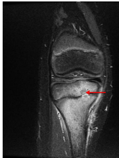
Figure 1. Medial tibial subacute osteomyelitis with a small intraphyseal Brodie's abscess (marked by red arrow).

noteworthy as Brodie's abscesses do not commonly form sinuses, secondly the physis of hip, elbow, shoulder and knee joints in very young children are intra-articular.