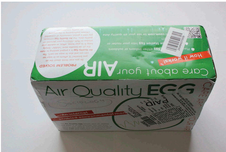
FIGURE 1 Air Quality Egg. (Color figure available online.)