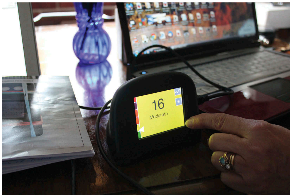
FIGURE 4 Setting up the Speck for monitoring particulate matter ( PM_{2.5} ). (Color figure available online.)