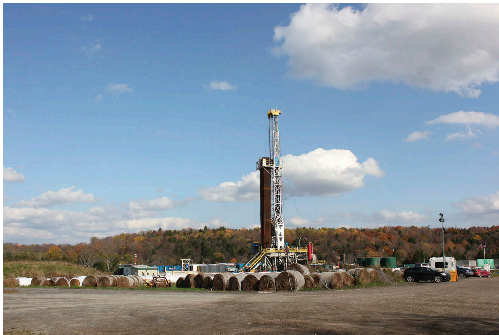
FIGURE 3 Fracking on the Marcellus Shale. (Color figure available online.)