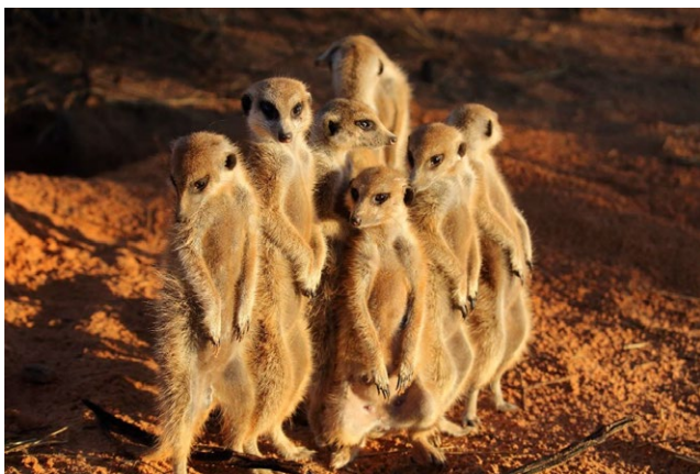
FIGURE 1 Family unit of cooperative breeding meerkats ( Suricata suricatta ) photographed at the Kalahari Meerkat Project (KMP) in the Kuruman River Reserve, Northern Cape, South Africa

Kalahari meerkats are cooperative breeders living in groups of 2–50 including an unrelated (or distantly related) breeding pair, which are dominant to all other group members of the same sex, and a variable number of closely related and highly familiar non-breeding subordinates of both sexes that help to rear young born to the breeding