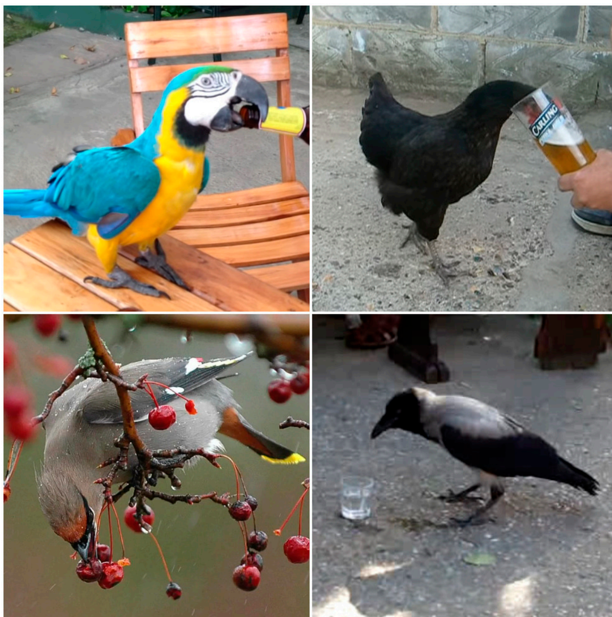
Figure 2. Examples from YouTube of birds drinking alcoholic beverages: (a) blue-and-yellow macaw Ara ararauna drinking beer in a pub in Columbia, https://youtu.be/nXZSVfT7UwI ; (b) hen Gallus gallus drinking beer, https://youtu.be/ubqHeliyVf4 ; (c) Bohemian waxwing Bombycilla garrulus eating ripe berries and subsequently having problems with flight, Canada, https://youtu.be/d_NqGjV3l_8 ; (d) hooded crow Corvus cornix drinking vodka, Hungary, https://youtu.be/xlq6GCekPNA .