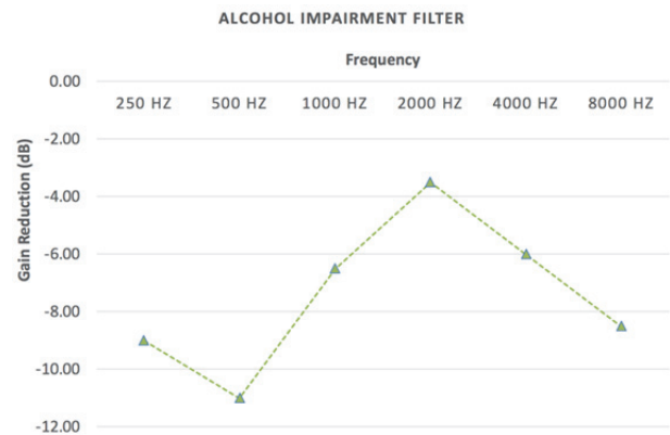
Figure 2: Audio Impairment Filter based upon average impairments from the averages for males and females reported by Upile et al. (2007)

This composition integrates findings of the study by Upile et al. (2007), gradually introducing filters, attenuation and distortion over the course of an abridged alcoholic binge drinking session that reflects the increasing impairment in auditory threshold. As shown in Figure 2, the dashed line shows the average value of the average impairments between males and females and was used to design the filter applied in the electroacoustic piece.