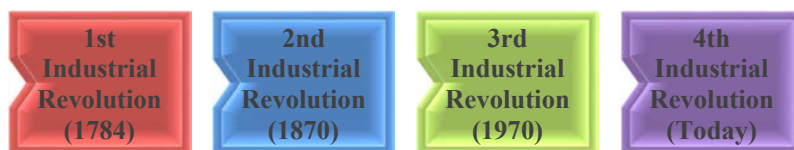
Figure 1: Industrial revolution [5].

According to [11], Internet of Things (IoT) or Cloud Computing technologies are terms stand for Revolution 4.0. Definition of fourth industrial revolution can be different as