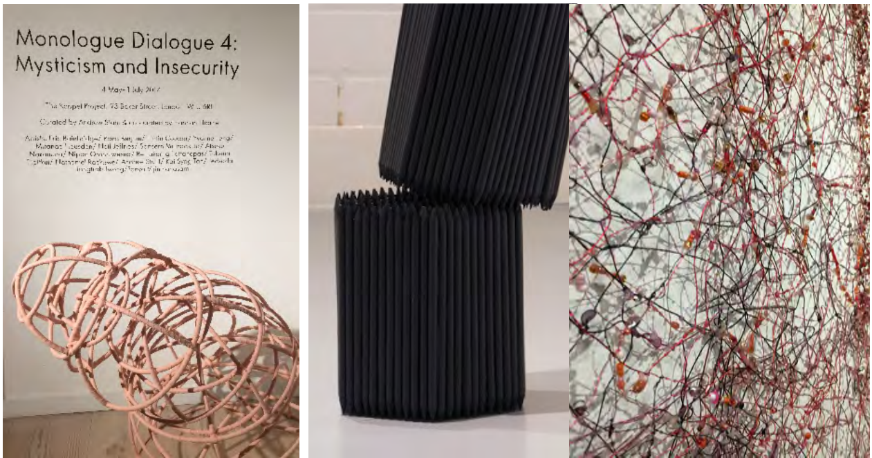
Left-right: Shameless (Miranda Housden 2017), Spellbound (Jedsada Tangtrakulwong 2017, close-up), Trans-Pollock (Be Takerng Pattanopas 2017, close-up).