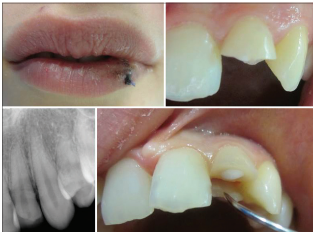
Figure 1: Images of injury of a fractured maxillary left lateral incisor

A healthy 11-year-old female patient referred for an aesthetic restoration of a fractured maxillary right central incisor (11) [Figure 5]. Dental history revealed that the tooth was fractured 1 month prior to presentation because of a bicycle accident. Her first dentist applied a root canal