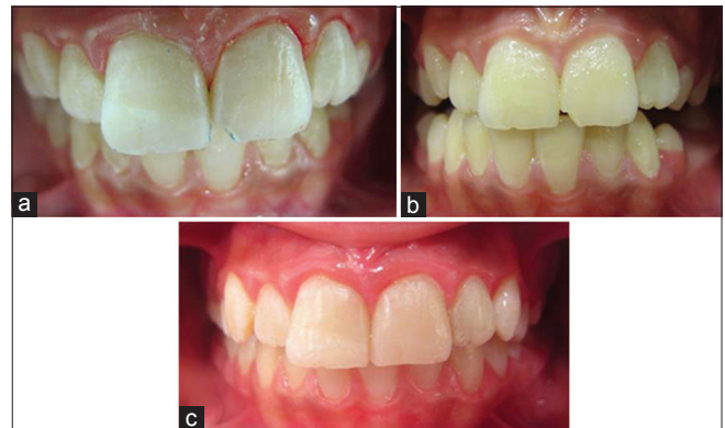
Figure 6: Postoperative images (a) immediately after reattachment showing dehydration (b) acceptable color in 2 weeks control (c) 1-year follow-up

treatment and suggested a temporary composite restoration until a crown restoration at the age of 18 for better clinical results. The parents hesitated for a final crown restoration and referred our university clinics in order to find a remedy. As they were informed about the treatment alternatives of a fractured tooth, her mother gave us the dehydrated fragment she kept with her ever since the accident. The fragment was placed in 2% chlorhexidine digluconate solution for disinfection and tried intraorally to check for proper positioning and fit with the fractured coronal structure. A written informed consent was signed by the patient's mother as the guardian before the treatment. Following clinical and radiographic examination, the endodontic treatment was found to be successful but a horizontally located mesiodense in the apex area was noticed. Since the lamina dura surrounding roots of both teeth could be detected separately, the mesiodense was followed-up closely for future recalls. The fragment and the tooth were acid etched for 30 s with 37% phosphoric acid gel, rinsed for 30 s and gently air dried. A one-bottle etch and rinse adhesive (Adper Single Bond 2, 3M ESPE, USA) was applied with a brush for 20 s and carefully air thinned. Flowable composite was placed over the fracture area on the tooth, and the fragment was placed over. The excess material was removed before light-curing for 40 s from labial and