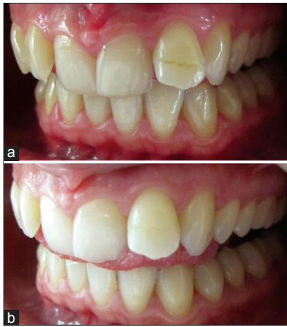
Figure 3: One year follow-up (a) marginal discoloration (b) easily removed by polishing