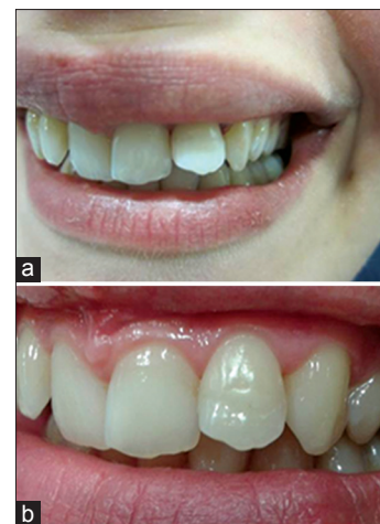
Figure 2: Postoperative images (a) immediately after reattachment showing color difference because of dehydration (b) harmonious integration of color in 2 weeks control