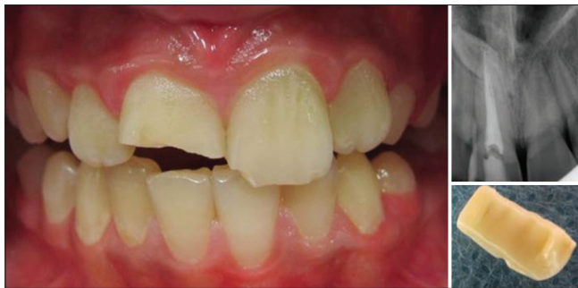
Figure 5: Preoperative images of a fractured maxillary right central incisor

treatment and suggested a temporary composite restoration until a crown restoration at the age of 18 for better clinical results. The parents hesitated for a final crown restoration and referred our university clinics in order to find a remedy. As they were informed about the treatment alternatives of a fractured tooth, her mother gave us the dehydrated fragment she kept with her ever since the accident. The fragment was placed in 2% chlorhexidine digluconate solution for disinfection and tried intraorally to check for proper positioning and fit with the fractured coronal structure. A written informed consent was signed by the patient's mother as the guardian before the treatment. Following clinical and radiographic examination, the endodontic treatment was found to be successful but a horizontally located mesiodense in the apex area was noticed. Since the lamina dura surrounding roots of both teeth could be detected separately, the mesiodense was followed-up closely for future recalls. The fragment and the tooth were acid etched for 30 s with 37% phosphoric acid gel, rinsed for 30 s and gently air dried. A one-bottle etch and rinse adhesive (Adper Single Bond 2, 3M ESPE, USA) was applied with a brush for 20 s and carefully air thinned. Flowable composite was placed over the fracture area on the tooth, and the fragment was placed over. The excess material was removed before light-curing for 40 s from labial and