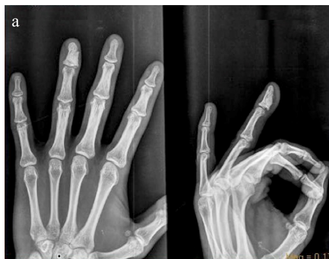
Fig. 3. Follow-up radiographs (a) and physical examination (b) at two years after surgery. Radiographs showed radiopaque interface and no evidence of local recurrence.

Osteoblastoma can be aggressive if associated with large epithelioid osteoblasts, and carries risk of local recurrence or malignant transformation into osteosarcoma [5]. These “aggres-