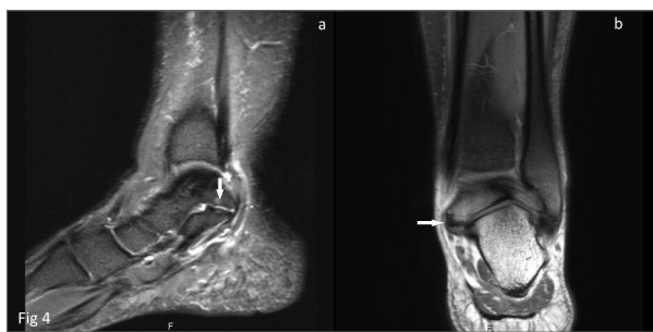
FIGURE 4. A) Coronal and B) Sagittal FS TSE PD images of the second patient show fibrocartilaginous talocalcaneal coalition (arrow) involving posterior facets of the subtalar joints. Minimal degenerative are changes associated with the coalition

nical stress during physical activity. The coalition becomes osseous due to repetitive injury and remodeling, resulting in rigidity or instability 2,4 . Ankle pain and stiffness are the most common complaints in patients with tarsal coalition. The limited movement of the affected ankle, in particular the impairment of subtalar inversion or eversion, is the most common physical examination finding. The coalition leads to peroneal spasm or adaptive peroneal shortening, peroneal spastic flat foot or rigid flat foot deformity 2 . Direct radiography is the first diagnostic method of choice for patients with suspected talocalcaneal coalition 1 . The most useful radiological indicator for tarsal coalition is the “C sign” observed in lateral radiographs and the talar beak sign 1,3 . The absence of the subtalar facet and dysmorphic sustentaculum tali in lateral radiographs are other useful findings for the diagnosis of talocalcaneal coalition 1,2 . The visualization of talocalcaneal coalition on direct graphs is sometimes difficult due