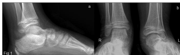
FIGURE 1. A) Lateral radiograph of the left ankle shows the talocalcaneal C sign, suggesting subtalar coalition across the middle subtalar joint. B) Deformed talus of the left foot is displaced in the antero-posterior view

Tarsal coalition is one of the most important causes of pes planus and may cause foot pain in children. Tarsal coalition is the congenital or acquired fibrous, cartilaginous or osseous fusion of one or more tarsal bones. Although the described incidence of this condition is approximately 1% of the population 1,2 , the proportion of asymptomatic cases is much higher 1 . The most common coalitions are talocalcaneal and calcaneonavicular coalitions, which account for 90% of the observed cases 1-3 . Talocalcaneal coalition is observed in approximately half of the cases and often involves the middle subtalar joint, a finding similar to that observed in the first case 2,3 . Fusion at the level of the posterior subtalar joint, as observed in the second case, is an extremely uncommon occurrence 3 . Most cases are asymptomatic in the first years of life; however, the pathology progresses gradually because of biomecha-