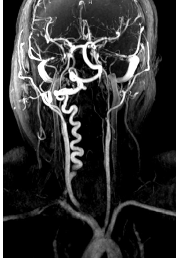
Figure 1. (a) Computed tomography image shows bilateral ossification of both auricular cartilage. (b) At contrast enhanced MR angiography right subclavian artery has irregular walls and advanced narrowing's. Bilateral internal carotid artery and left vertebral artery are not filled with contrast material. Origin of the right vertebral artery is narrowed apparently. However after that there is a dilated and tortious course of that artery. Cerebral circulation was fed by right vertebral artery.