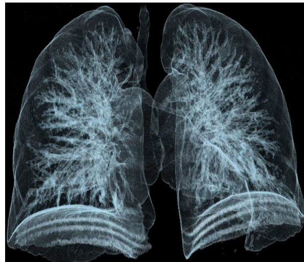
Figure 2. (a) Coronal reformat computed tomography image demonstrates diffuse tracheobronchial thickening and left main bronchus narrowing. (b) 3D volume rendering image shows left main bronchus narrowing.