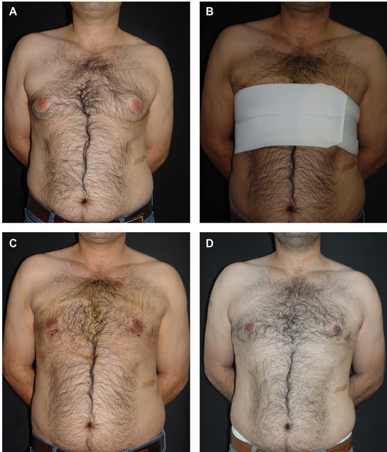
Figure 2. (A) A 31-year-old man with grade II gynecomastia. (B) After 6 minutes of cavitation, total of 600 mL liposuction was carried out. One week after the surgery with compression garment. (C) Without compression garment. (D) Postoperative month 17.

(range, 17-55 years), and their mean body weight was 64 kg (range, 58-88 kg). The distributed severity of gynecomastia was as follows: 41 patients were classified as grade 1, 85 patients were classified as grade 2, and 12 patients were classified as grade 3 (Table 1). In 23 patients, the glandular tissue