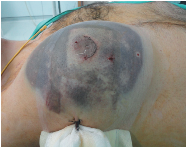
Figure 3. Postoperative hematoma after removal of the breast tissue through the subareolar incision was not prevented with a closed-suction drain.

appeared to drape normally after the compression garment was removed (Figure 2). Clinical examination of all 276 breasts revealed only 1 postoperative hematoma. This was a hematoma on a single breast, and only liposuction was performed. All patients were tracked postoperatively, with an average follow-up time of 14 months.