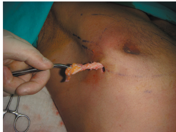
Figure 1. Removal of the glandular tissue with the pull-through technique via a liposuction incision.

The residual glandular tissue, located mostly in the sub-areolar area, was pinched after completing the liposuction to evaluate volume; it was then removed by the pull-through technique using the same incision employed for the liposuction. 3 To surgically excise the gland, it first was pinched between the thumb and the index finger, grasped using a Mosquito forceps, and then passed through the skin incision made for the liposuction. When the forceps was pulled, the edge of the glandular tissue was exposed. The gland was freed from the surrounding tissue by cutting with scissors in different directions (Figure 1). This maneuver was repeated