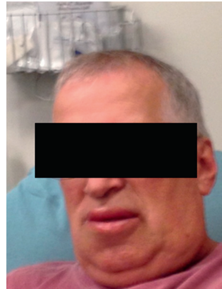
FIGURE 1: Patient with symmetric lip swelling of upper and lower lips.

Complete blood count revealed a white blood count of 4900/\mu\text{L} (normal: 4,800–10,800/ \mu\text{L} ), hemoglobin of 12.4 (normal: 14–17.5 g/dL), and platelets of 149,000 (normal: 130,000–400,000/ \mu\text{L} ). Lactic acid, sedimentation rate, C-reactive protein, lipase, and liver function tests were normal. Considering the bouts of unexplained bowel edema and swelling lips without hives, a diagnostic workup for angioedema was pursued. Functional C1 esterase inhibitor level was found to be 4% (normal: >40%), along with C1 esterase inhibitor antigen of <3 mg/dl (normal: 21–39 mg/dl), C4 complement < 1.7 mg/dl (normal: 12–38 mg/dl), and low normal C1q level of 113 \mu\text{g/ml} (normal: 109–242 \mu\text{g/ml} ). C3 complement level was normal at 88.6 mg/dl (normal: 59–152 mg/dl). C. difficile stool toxin test during this admission was negative. Stool samples were also negative for Salmonella , Shigella , Escherichia coli , Campylobacter , Yersinia enterocolitica , Giardia , Vibrio , and Aeromonas . CT abdomen and pelvis (Figure 2) showed jejunal enteritis with progressive duodenitis and stable abdominopelvic lymphadenopathy. A repeat C1q level performed 6 months later was low at <50 \mu\text{g/ml} (109–242 \mu\text{g/ml} ).