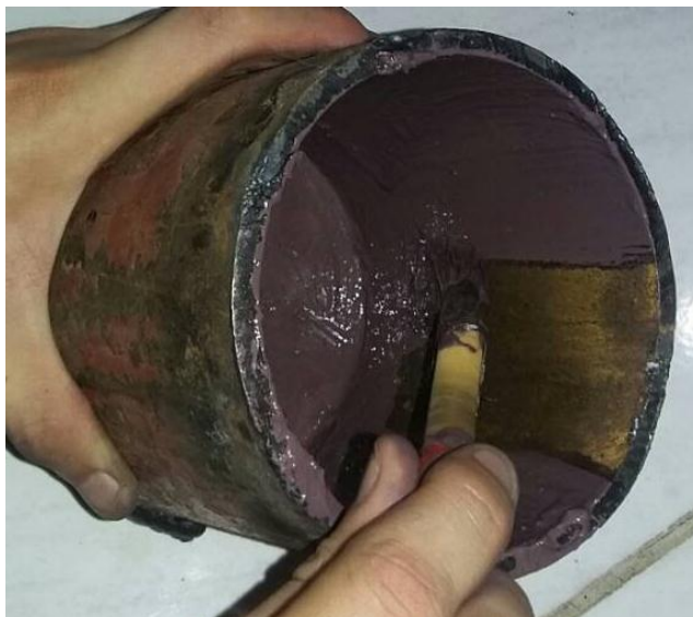
Fig. 1. Steel crucible coating.

To prevent iron diffusion to the aluminium melt, the inner wall of the steel crucible used in this work was coated prior to melting process (Figure 1). Iron diffusion to the aluminium should be prevented since iron deteriorates mechanical properties of aluminium alloys [3].