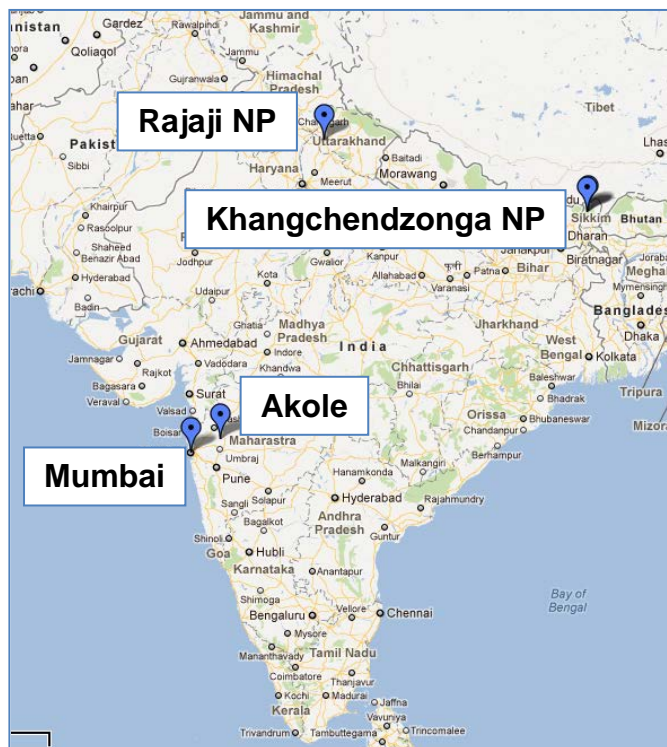
Figure 5: The study areas

Altogether these contributions will represent a great amount of data.