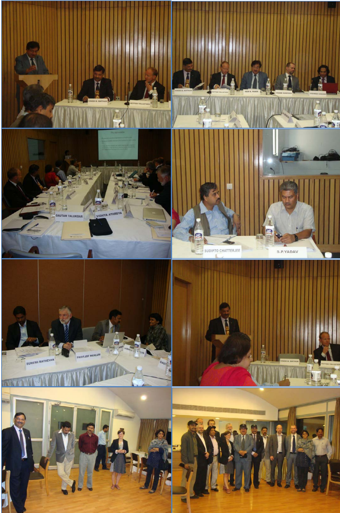
Figure 1: Picture gallery from the kick-off meeting.