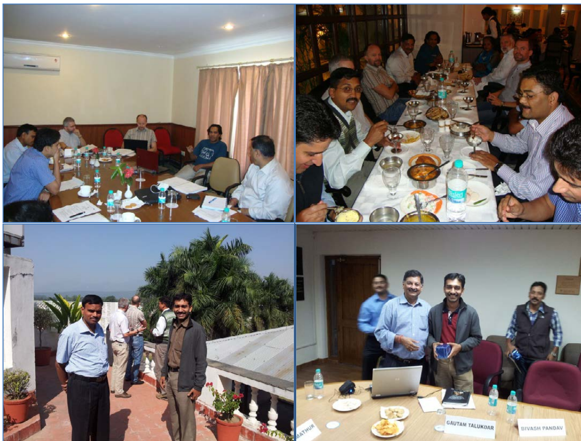
Figure 2: Picture gallery from the workshop.

The pilot project core team (representatives from WII, NINA, NBIC, GBIF and the Museum for Nature History at the University of Oslo) met in Dehradun 29.th to 30.th October 2011 in order to design the content and plan the progress of the pilot project.