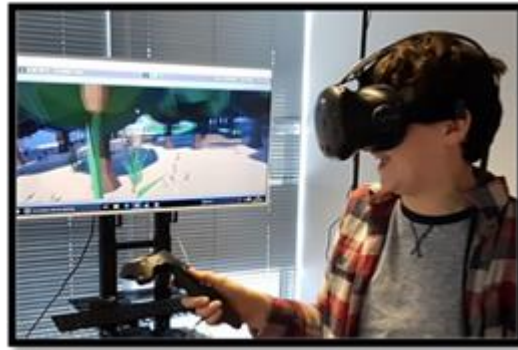
Figure 2: Virtual Reality Headset [12]

The figure above shows a child with autism using virtual reality headset to learn. The headset helps students to learn and collaborate with other students.