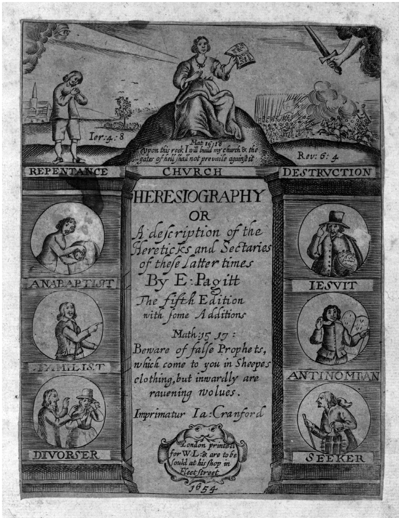
FIGURE 1: Title page, Ephraim Pagitt, Heresiography (London: 1654).

Courtesy of Houghton Library, Harvard College Library *EC P1483 645hg.