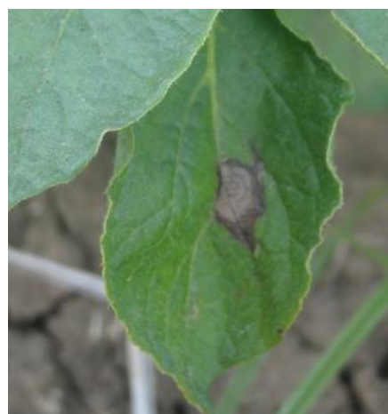
Figure 1: The early blight disease represent as rings in potato plant leaves.

The S. tuberosum belonging to the Solanaceae family of the order Solanales is grown in more than 100 countries around the world. The favorable environmental condition for its production belongs to the temperate, sub-tropical and tropical zones. Mostly cultivated by planting tubers, the temperature range for its optimum growth lies between 18°C to 20°C (64°C to 68°C) 1&2 . Potatoes are a rich source of carbohydrates, vitamin C, some of the B vitamins, potassium with a low protein and fat content. They are an excellent supplier of energy rich diet. The antioxidant activity reported in potato is also quite good. The financial and nutritive deal with potatoes is very profitable 3 &4 . The antioxidants found in potatoes are glutathione, ascorbic acid, quercetin and chlorogenic acid. These are soluble in water and act as free radicals 5 . The “King of vegetables” is consumed by more than 1 billion people around the world because of its great nutritive value. All of the fungal diseases mentioned before are quite a disaster for growth and maturation of potato.