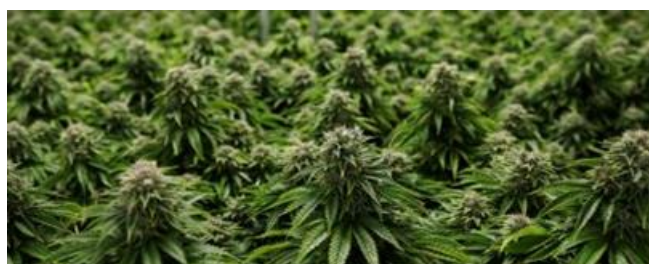
Figure 1: Cannabis Plant

A large amount of people's money in south Asia is spending to buy expensive medicine which is derivatives from cannabis to treat Epilepsy, Parkinson's, other mental illness and many more. Actually, the government is doing crime on peoples because forcing to buy medicine from the western world which is discovered from cannabis but not allowing peoples to involve in cannabis in Nepal. Even our local practitioners make various formulation based on it to treat many diseases, these days getting cannabis becomes difficult, and more scare from police administration makes unhealthy; as we know our large population depends on traditional healers.