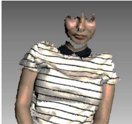
Fig. 4: Scanning curly hair.

The problem occurred when scanning the curled hair structure, where the scanner could not even capture their contour (Figure 4). The simplest and recommended scan is when the long hair is tied up [9, 10].