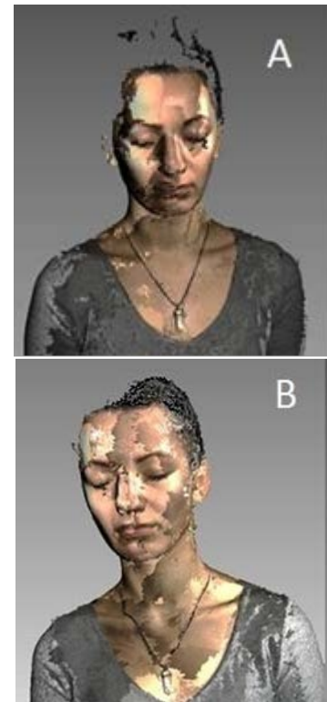
Fig. 2: Hair Scanning, A) Without water application, B) After water application.