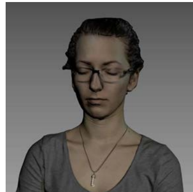
Fig. 6: Model with eyeglasses.

As can be seen in Figure 5, the end of the subject's beard hair is blurred. This may be due to the fact that the ends have been greatly split.