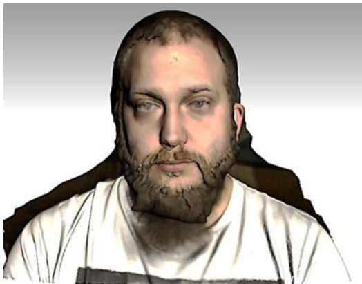
Fig. 5: Shooting eyes and thick beard.

The subject felt bad about scanning his eyes because the scanner has a high frequency of LED flashing. It is important to remind that scanning cannot damage the subject's eyesight. It was assumed that the eye's color texture will not be captured on the 3D output model of the person being captured because the cornea itself is clear and has a glossy surface. As can be seen in Figure 5, the scanner has completely scanned the eyes and their area adjacent area.