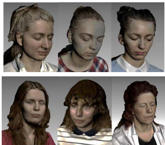
Fig. 3: Overview of the scanned hair types.

In order to obtain a better 3D model, water applied to the hair was used to obtain a more detailed output, as demonstrated by the particular models (Figure 2B). As you can see after applying water to the hair, it was possible for the scanner to capture much of the hair compared to no water (Figure 2A). All the noted hair types are shown in Figure 3, where it is clear that hair color does not affect the scanning process.