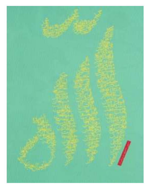
Figure 1. Melissa Shadras - The 6th National Bi-sme Allah (in the name of God) Festival