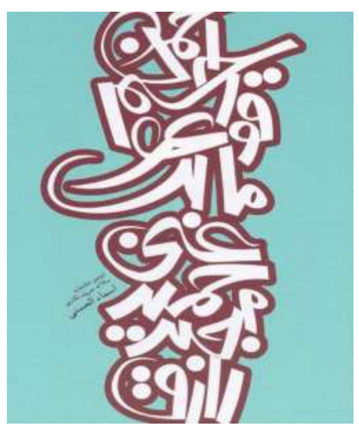
Figure 9. Hamed Zare - Second Annual calligraphy Exhibition of divine names Asma Al-Hassani

Of course, in the above examples, typographers have tried to perfectly match the form and the content, and there are other works that are only considered to be beautiful in terms of visual elements, as in the following examples (Figure 9).