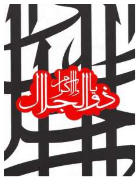
Figure 10. Hossein Josbaši - Second Annual calligraphy Exhibition

Hamed Zareh in his work, by using the positive and negative space and creating graphical textures based on the type of letters design with linear values of side lines in warm colors on the background of blue sky and axial composition, and creating a cool and warm contrast, has represented a beautiful structure. (Figure 9).