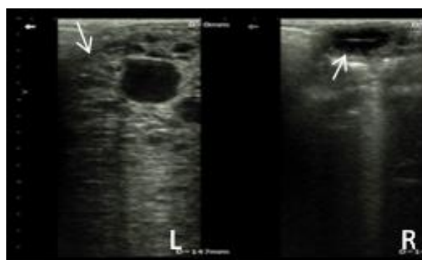
Figure 1. Ultrasonography images of the ovaries in a granulosa-theca cell tumor (GTCT). The GTCT appear as a multicystic structure with dense areas (L). The inactive right ovary appears as a small hypoechoic structure (R).

Anamnesis: the brown color mare named Djulhizah, age 4 years old, sex female, and weight 450 kg. Clinical symptoms: aggressive stallion like behaviour and anoestrus, does not get pregnant after many trials of natural mating. Physical examination: heart rate 40 times/minute, respiratory rate 20 times/minute, and body temperature 38.0 °C. Diagnosis: a large hard mass at the left ovary was found by rectal palpation. By ultrasound diagnostic was confirmed that hard mass was GTCTs that measures a diameter of 147 mm of the left ovary and hypofunction of the right ovary (Fig. 1). Prognosis: fausta. Treatment: The GTCT was decided to remove by midline laparotomy due to the large size of tumor.