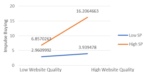
Figure 2. Moderation plot of sales promotion

Another finding from this study is related to the role of consumer’s personal factor (fashion consciousness) in affecting impulse buying of fashion products. The result suggested that e-commerce websites/platforms should align their marketing efforts with the consumers’ interest or involvement with a product category, particularly fashion items which may carry profound personal relevance and perceived risk (e.g., risk of wearing out of season fashion). Besides, in the long term, e-commerce websites/platforms that sell fashion clothing can invest in various marketing communication activities to stimulate fashion consciousness of their future target markets, as well as to maintain the fashion consciousness of the existing target markets.