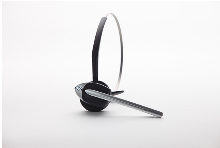
Fig 1. Quail digital wireless headset.

https://doi.org/10.1371/journal.pone.0220214.g001