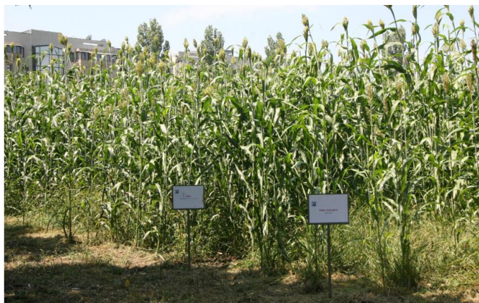
Fig. 1. The culture of sugar sorghum

the heated juice does not stick to the bottom of the boiler (distillation vessel).