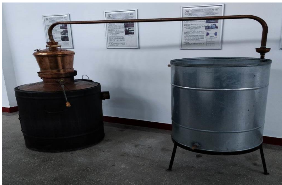
Fig. 3. Installation for distillation / obtaining raw alcohol (IOAB)