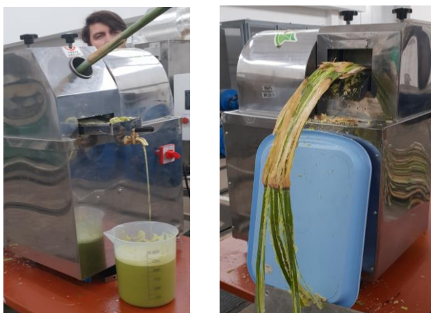
Fig. 2. Pressing of the sugar sorghum stalks and obtaining the juice