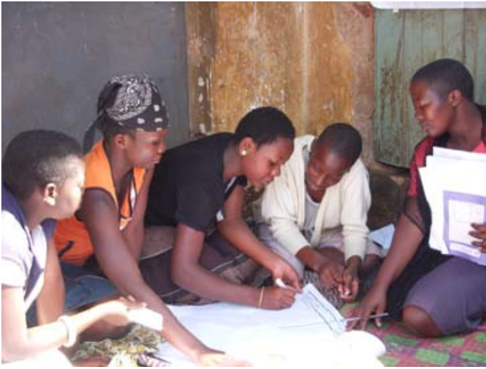
Older adolescent girls meeting in their safe spaces group for a financial education session on ways of earning money.

FINCA-Uganda), the Council has successfully developed a savings account that provides girls with a financial service specifically suited to their needs within a program model that expands access to safe spaces, strengthens girls' social networks, and provides them with financial education and basic health education. Once girls open their account, they join a savings group that meets weekly in the community under the guidance of a mentor who facilitates training and group discussion. These mentors are young women from the community who are trained by the program, serve as critical role models for the girls, and contribute to building young female leadership at the community level. The financial institutions also hold periodic meetings with parents to gain parents' support and to provide information on financial services to the adults. Initial results from the pilot program in Kenya indicate a positive impact on girls on a range of indicators. Program participants showed positive changes in social networks and mobility, gender norms, financial literacy, use of bank services, saving behavior, and communication with parents/guardians on financial issues. Following are some benefits of the Kenya program that were shown in the pilot evaluation results (which included girls with savings accounts as well as a comparison group):