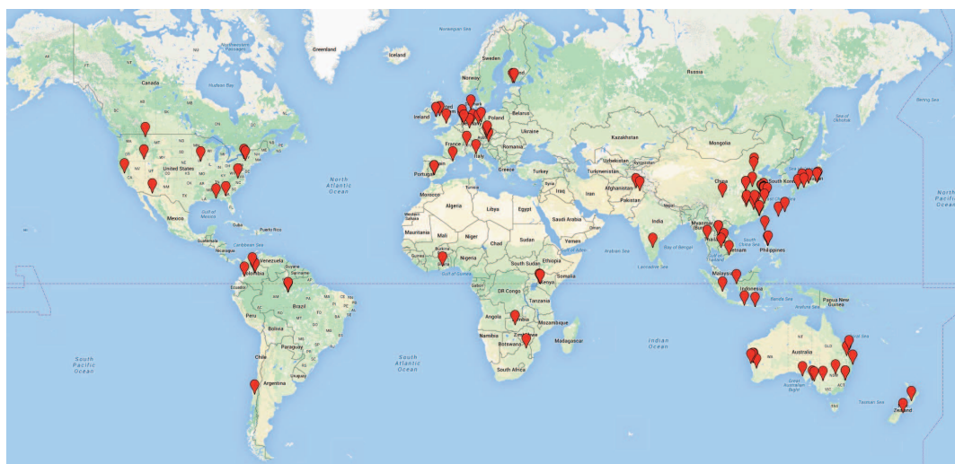
Figure 2. Map showing the global distribution of the 107 experimental sites included in the meta-analysis database for which data location data were available. Note that each marker may represent several studies published by the same research institute.

biochar application rate of 15 \text{ t ha}^{-1} (online supplementary figure 12). These results show that the effects of biochar on yield cannot be extrapolated from tropical to temperate regions [20]. The reason for the differences in application rates between temperate and tropical systems is unclear. However, it is likely impacted by the fact that potential feedstock materials are more restricted in the tropics, where the produced biomass is generally used for other purposes [20]. That yield increases were seen in tropical soils despite the lower biochar application rate used for temperate soils provides evidence for the hypothesis that yield benefits derive from a nutrient effect. If the nutrients that can be provided by the biochar are already not limiting to crop growth, as is more likely the case in the relatively fertile temperate soils compared to tropical soils, then adding more nutrients is unlikely to have any impact [21].