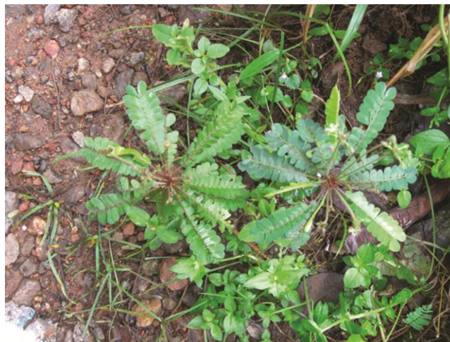
Fig. 1 — Aerial view of Biophytum sensitivum (L.) DC

The EDXRF technique was used to identify the elemental constitution of the leaves and roots of