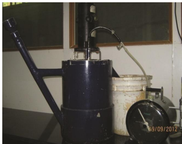
Plate 1 — 25 L lab scale fixed dome bioreactor

Volatile fatty acid (VFA) and methane analysis were done by gas chromatography (Clarus 500, Perkin Elmer, USA), equipped with flame ionization detector (FID) and thermal conductivity detector (TCD). VFAs were analyzed using FID and capillary