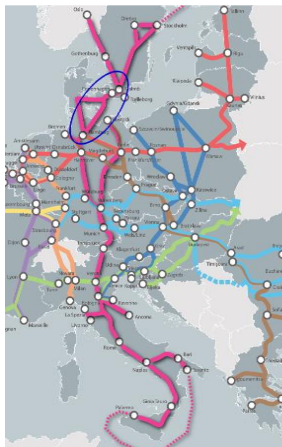
Figure 1. Ten-T corridors and case region

The Swedish initiative was paralleled by a number of EU financed Interreg projects dealing with green freight transport corridors such as the Supergreen project, East West Transport Corridor, Scandria, Sonora, and Transbaltic. Many of these projects use the same definition based on a greening of freight transport through co-modality and efficiency (Engström, 2011). One pioneering project was the Supergreen project, which worked on identifying green freight corridors within the European transport network, and later became a basis for the future development of green corridors at the European Commission (Schulze,