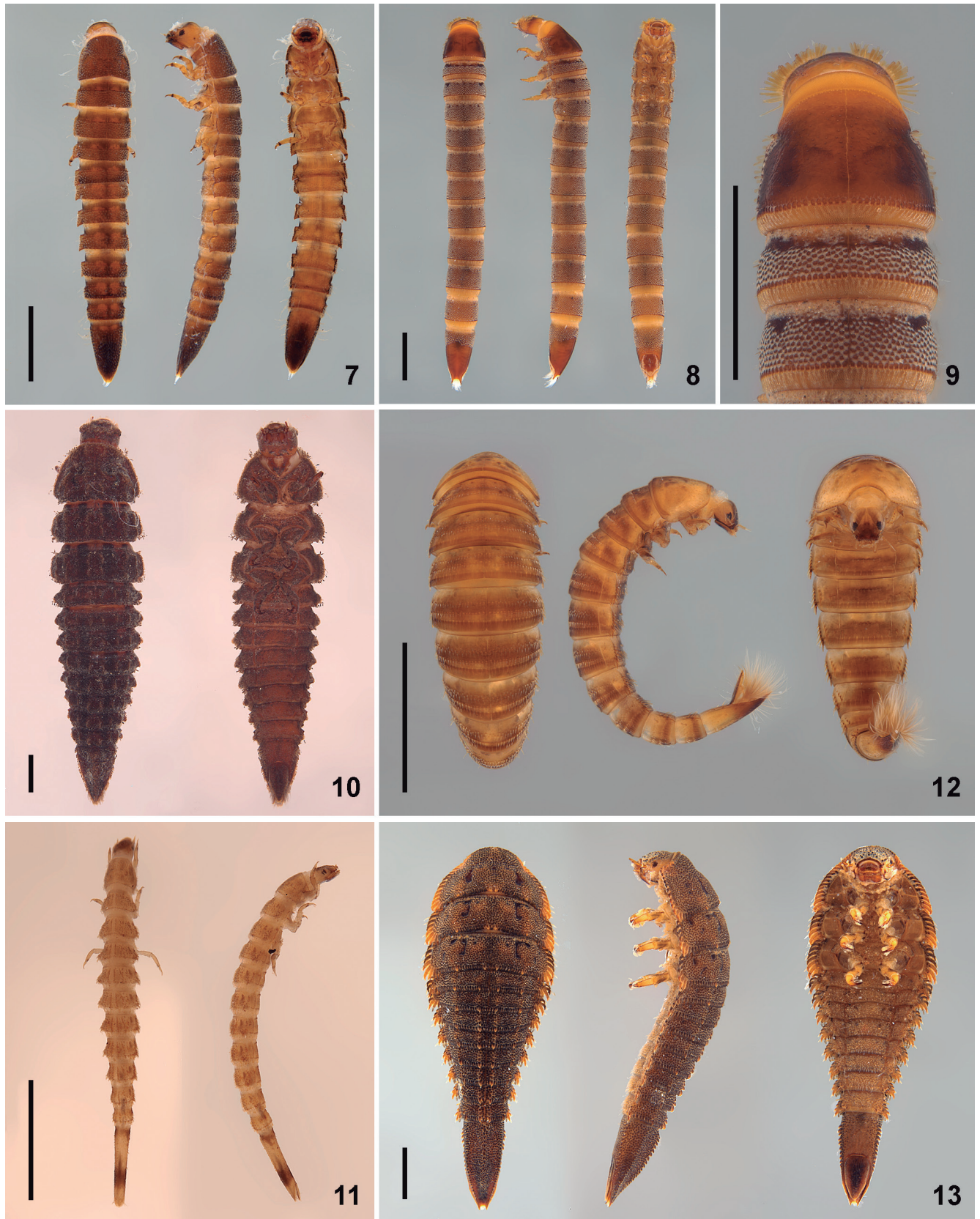
Figures 7-13. Larval habitus. (7) Larva Z, dorsal, lateral, ventral; (8) Stenhelmoides Grouvelle, dorsal, lateral, ventral; (9) Stenhelmoides Grouvelle, head and thorax, dorsal; (10) Potamophilops Grouvelle, dorsal, ventral; (11) Elachistelmis Maier, dorsal, lateral; (12) Xenelmis Hinton, dorsal, lateral, ventral; (13) Stegoelmis Hinton, dorsal, lateral, ventral. Scale bars = 1 mm.

cept posterolateral corners more strongly produced and extending ventrally; corners with several spines. AB IX 3× as long as wide; with middorsal ridge, two lateral ridges and two ventrolateral ridges, pentagonal in cross sec-