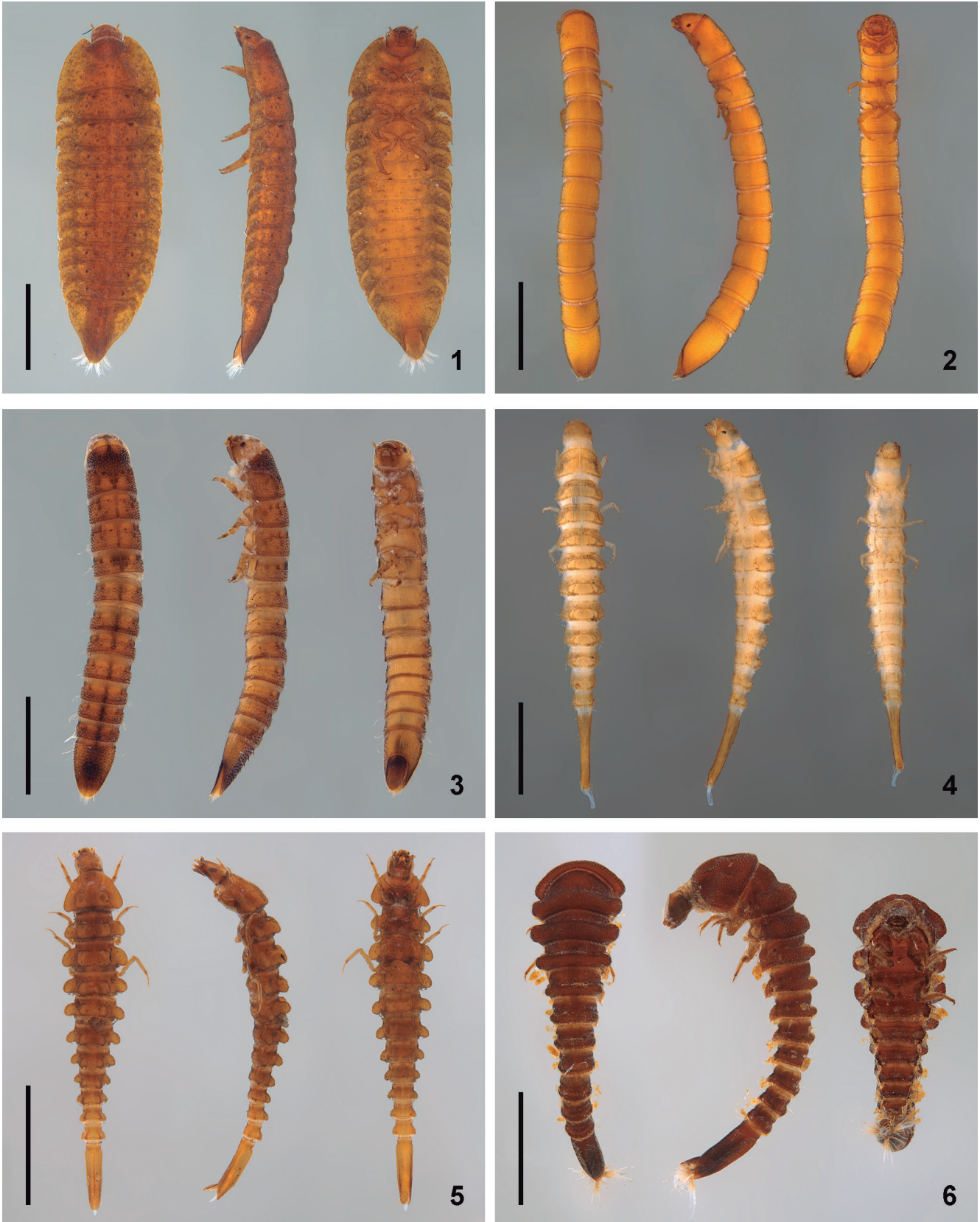
Figures 1-6. Larval habitus (dorsal, lateral, ventral). (1) Phanocerus Sharp; (2) Gylloepus Erichson; (3) Larva V; (4) Austrolimnius Carter & Zeck; (5) Neolimnius Hinton; (6) Larva W. Scale bars = 1 mm.

small depression on posterolateral corner); middle area broadly raised; posterior border arcuate. Mesonotum with posterior half raised in broad, rounded ridge extending between posterolateral corners; posterolateral