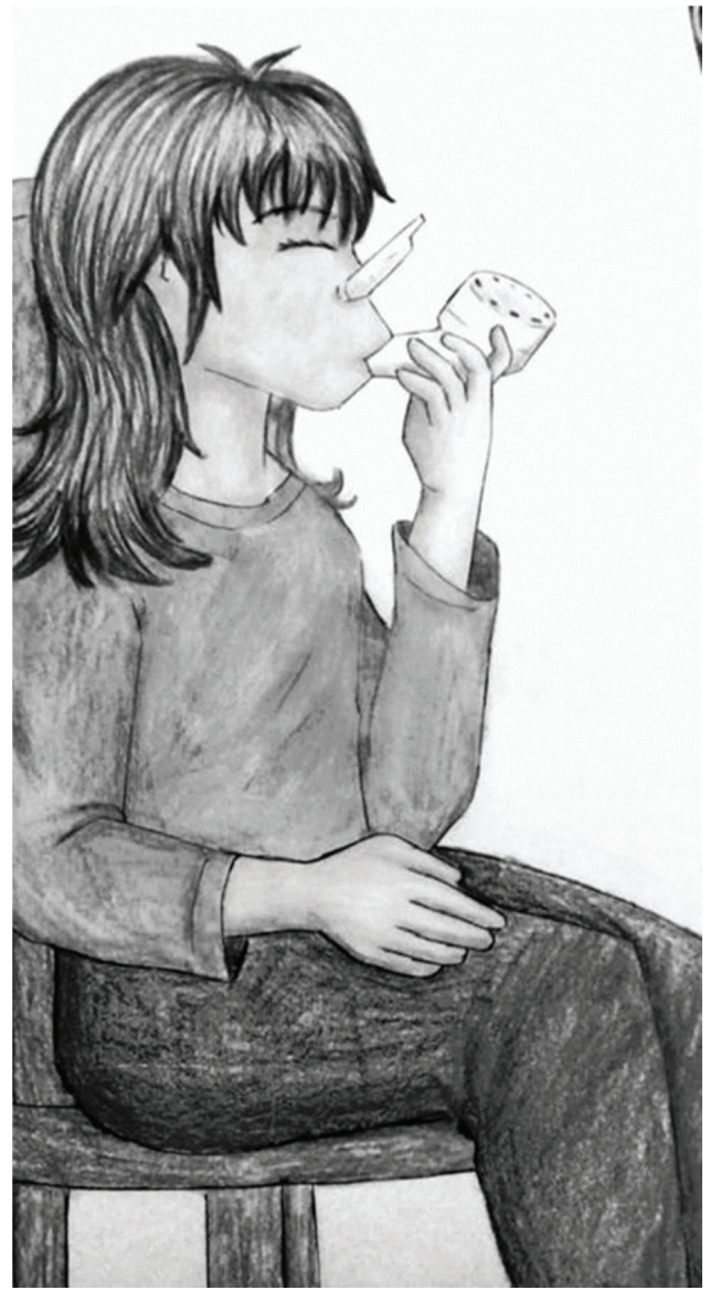
Figure 2 - Illustrative image showing a patient performing oscillating positive expiratory pressure therapy for 5 min in a sitting position.

All samples were processed according to the previously published protocol (18). Briefly, sputum was separated from