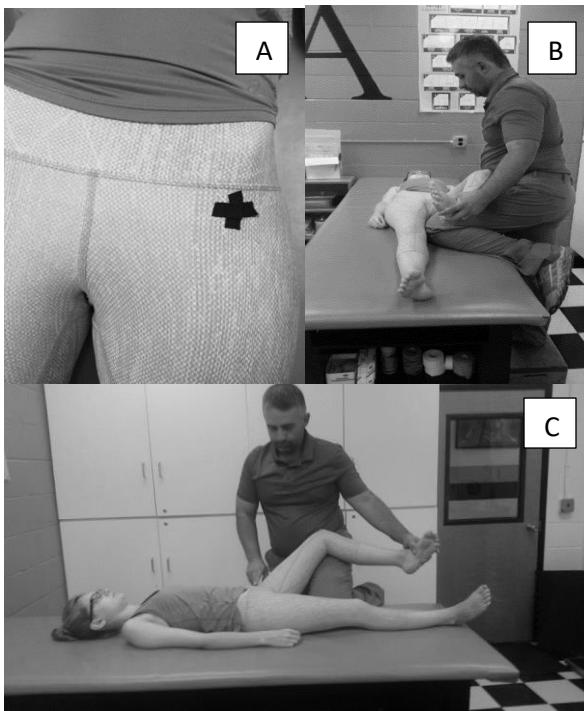
Figure 1 Examples A-C picture the RI TrP and PRT technique utilized for the apparent lateral ankle sprain. (A) TrP along the ipsilateral Sartorius origin indicated by the “X”. (B) Caudal view of the PRT Sartorius release technique. (C) Side view of the PRT Sartorius release technique.

The Disablement in the Physically Active scale (DPA) is a patient related outcome designed to assess a patient’s perception of their injury and how it effects the quality of life and/or physical activity. The DPA is completed by the patient and ranges in scores from 0 to 64, with a lower score indicating less impact on daily life functions. 28 The MCID values related to DPA have been calculated at nine points, for acute injuries, and six points, for chronic injuries. 29 The utilization of the Patient-