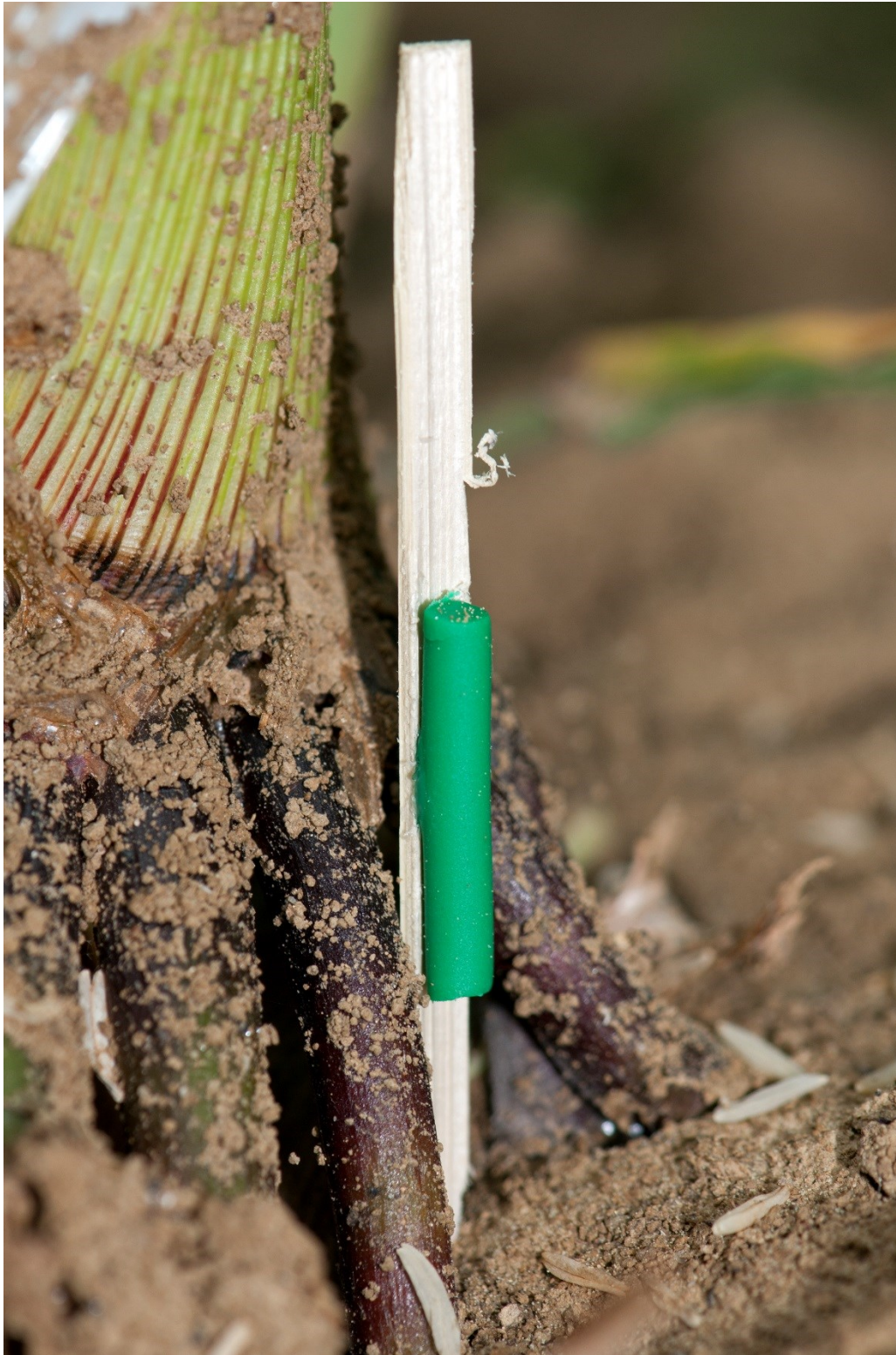
Fig.1 An artificial caterpillar exposed at the base of a maize plant, as if it were about to climb the maize stem.