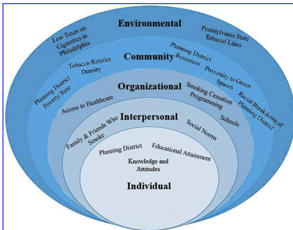
FIG. 2. Social Ecological Model framework with key factors that influence smoking in Philadelphia.

Planning district resources affect smoking; neighborhoods with a lower number of resources have higher rates of smoking