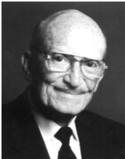
Fig. 1. Ralph Cloward (courtesy of the Western Neurosurgical Society).

In an interview with Roy Selby, Ralph Cloward (Fig. 1) reflected on the Cushing Society reaction to his presentation of 100 posterior lumbar interbody fusions in 1946. Cloward recalled the prevailing sentiment of the time, “We are neurosurgeons, and as such we should confine our activities to the trephine and the rongeur and leave the chisel to the orthopedic