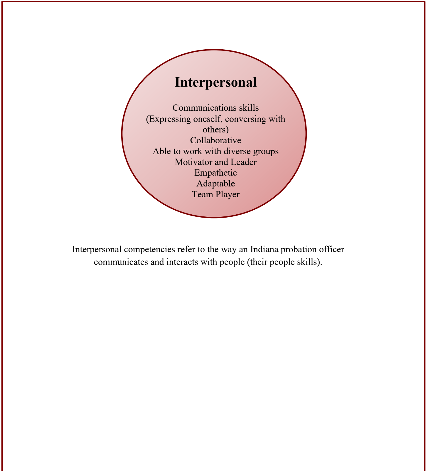
Figure 2 Interpersonal Competencies