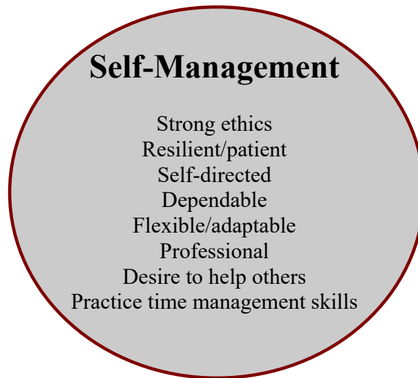
Figure 4 Self-Management

Self-management competencies refer to how Indiana probation officers manage and express themselves.