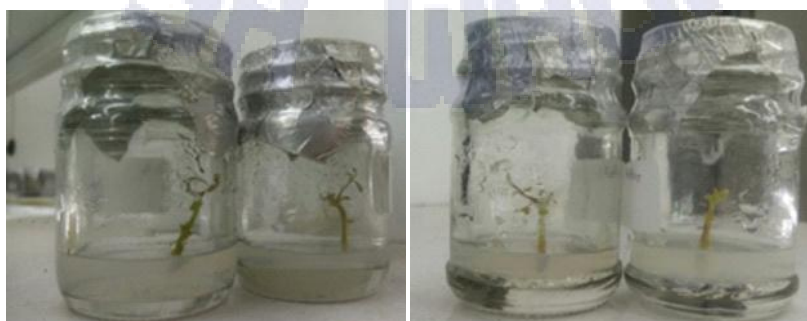
Picture 2. The results of S. Rebaudiana shoot culture in vitro with the addition of Plant Growth Regulator for 21 days

This research was conducted from March to June 2018 at the Plant Tissue Culture