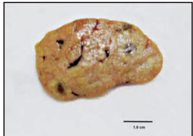
Figure 4. Diffuse yellow granulomas in markedly vascularized spleen measuring approximately 3.0 cm in length. At the cut, 90% of the tissue was replaced by granulomas adjoining with each other.

transmission, even though oral route cannot be ruled out considering the alterations in the intestine walls and the presence of Mycobacterium -like bacilli in intraluminal space. The oral route has been described as the primary mode of transmission for infected animals in contact with contaminated water and soil [21,25]. However, further studies are requiring to elucidate the characteristics and clinical signs of this disease in harpy eagles and other raptors.