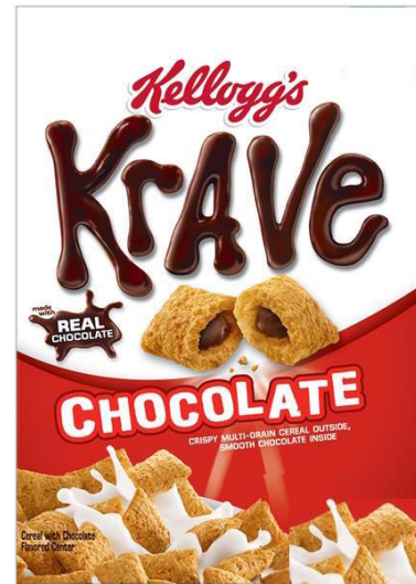
Fig. 2. Cereal products used: (a) All Bran Facts Up Front; (b) All Bran Facts Up Front extended; (c) All Bran Healthy Check; (d) Krave Facts Up Front; (e) Krave Facts Up Front extended; (f) Krave No-Check