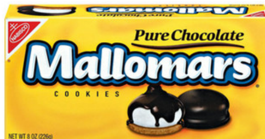
Fig. 4. Snack products used: (a) Nilla Wafers Facts Up Front; (b) Nilla Wafers Facts Up Front extended; (c) Nilla Wafers Healthy Check; (d) Mallomars Facts Up Front; (e) Mallomars Facts Up Front extended; (f) Mallomars No-Check