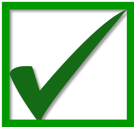
Fig. 1. Front-of-Package labeling formats used: (a) Facts Up Front; (b) Facts Up Front extended; (c) Healthy Check