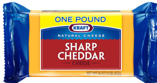
Fig. 3. Dairy products used: (a) Kraft Slice Facts Up Front; (b) Kraft Slice Facts Up Front extended; (c) Kraft Slice Healthy Check; (d) Kraft Cheddar Facts Up Front; (e) Kraft Cheddar Facts Up Front extended; (f) Kraft Cheddar No-Check