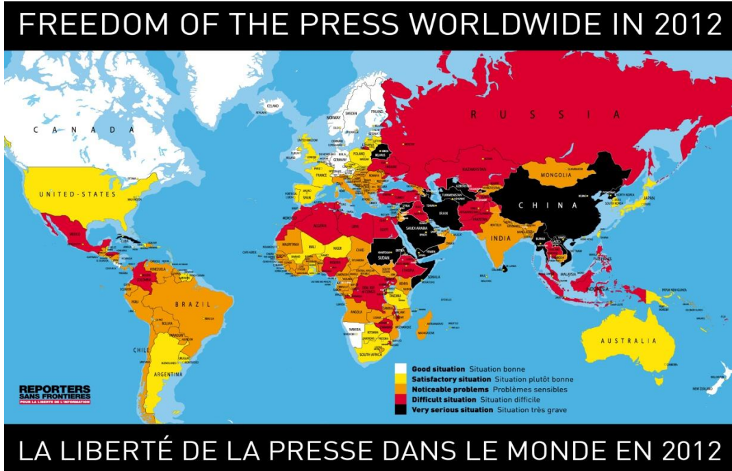
Figure referenced from en.rsf.org/press-freedom-index-2011-2012,1043.html

Again, much like the data on post-materialism we can see that the existence of a free press is largely concentrated among modern industrialized democracies. These states tend to cluster in Western Europe and North America.