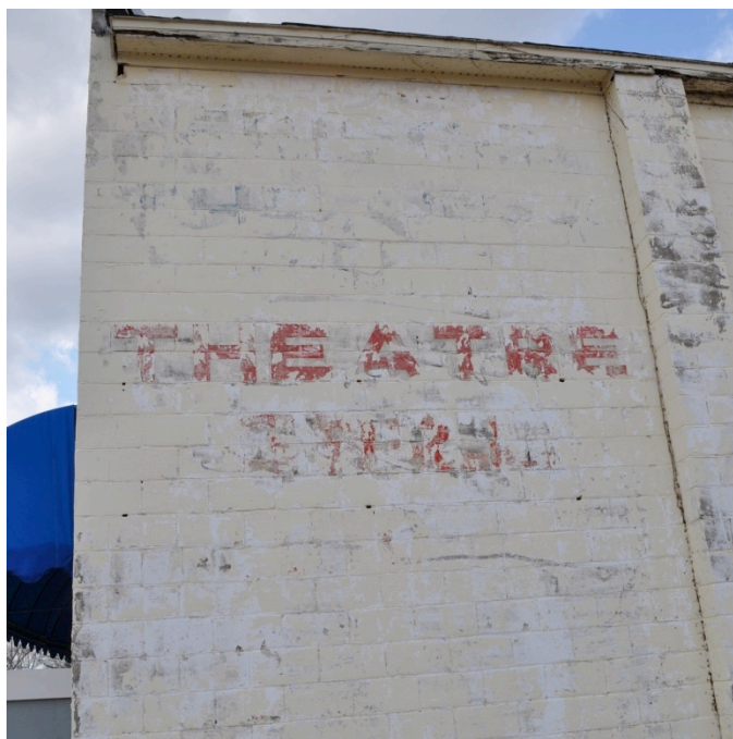
Figure 7. Four lines of old lettering discovered on the theater building.

According to the RFC members, interest in the town “becomes contagious” when “one or two people step forward” in enthusiastic commitment to the mission of reviving Frisco City. Interest often becomes involvement; Anne Brown stated that the idea of “bunch of women in [the old barbershop building] with power tools” proved unnerving enough to recruit some men in the community, who volunteered some time, building materials, and labor to help RFC with that project and who have since become increasingly involved in the group’s activities. Walston ventures this statement about other curious townspeople: