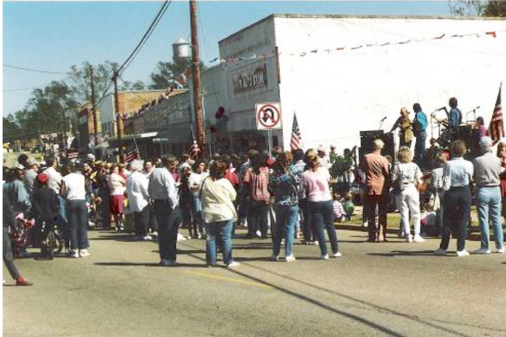
Figure 5. Entertainment on Bowden Street, Frisco City Centennial celebration, 1988.