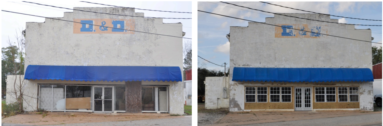
Figure 6. Changes to the old theater building between November 2010 and February 2011.

When the Norwoods power-washed the side of the building, the peeling paint revealed the words “Theatre,” much to their surprise, and to the shock of other residents who also did not know that a theater had ever existed in Frisco City. The conversations the simple lettering prompted between questioning young people and older residents who remembered the theater illustrated the significance of the downtown built structures in aiding the sharing of memory and identity between generations of Frisco Citians. The Norwoods, fascinated by the power of the letters to generate conversation, interest, and therefore community pride, in Frisco City, decided not to paint over them. 191 The picture below from February 2011 shows that the line of lettering that the Norwoods found is merely one of several that, at different times, identified the building.