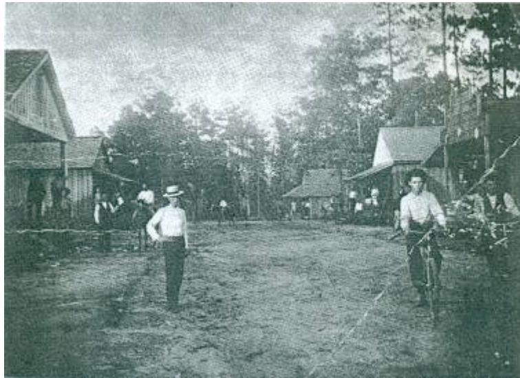
Figure 1. Jones Mill Main Street in 1897. This photocopy appears in Blanche Haigler Borum’s “History of Frisco City,” Monroe County Museum and Historical Society Quarterly , vol. 2, no.3 (Fall, 1998). The original photograph’s location is unknown.

ideas that were the foundations of many rural small towns. 29 Jones Mill’s gristmill and sawmill were community centers that attracted people and their businesses, churches, and schools to the area. 30 It is significant that the first name of the community reflected its affiliation with its “central places”; the people who began to identify themselves as residents of “Jones Mill” claimed the places as their own, and began forming community ties based on their shared congregating spaces. 31 Soon the town had a busy main street lined with wooden buildings, including a doctor’s office and the new Jones Mill Post Office. 32