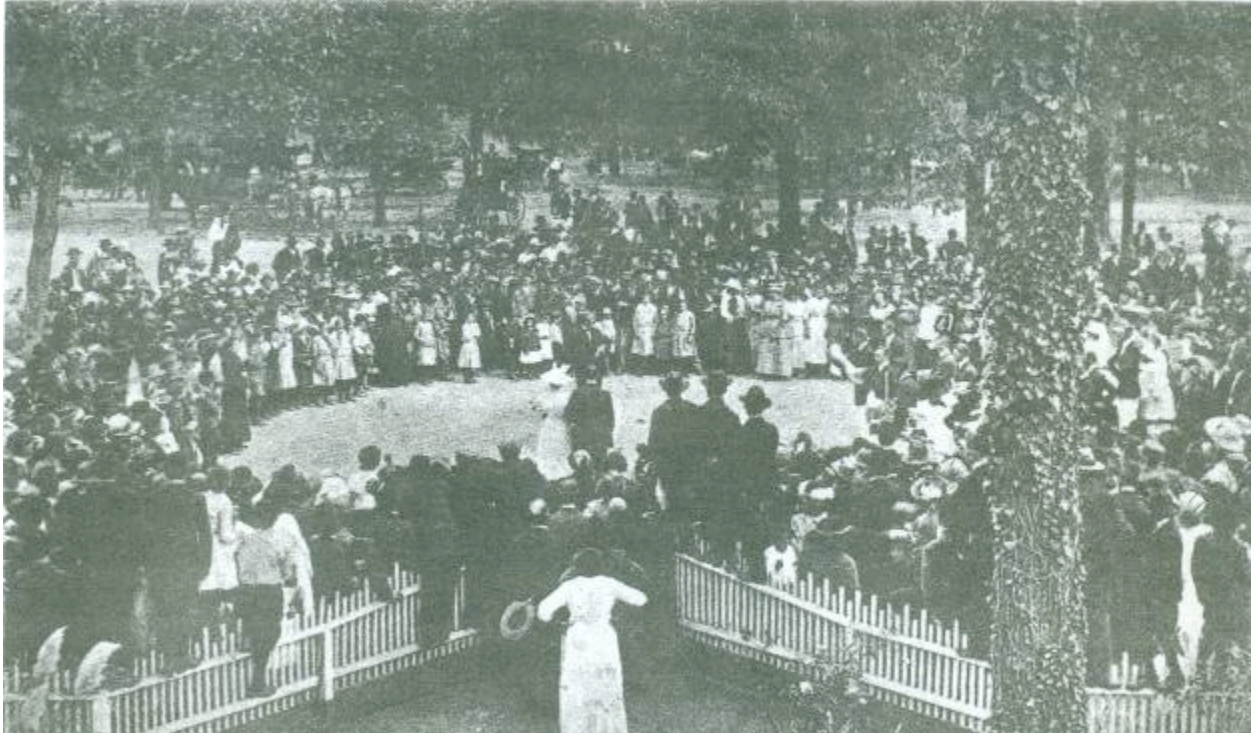
Figure 2. Public wedding at the celebration of the “Grand Opening of Roy, Alabama.”

The promised railroad never materialized, so in 1919, just six years after Jones Mill became Roy, the town returned to its original name. In 1922, the G.F.&A. Railroad (also known as the “Deep Water Route”) came under the ownership of the Muscle Shoals, Birmingham, and Pensacola Railroad company, which did continue the long-awaited line through Jones Mill. In 1925, the St. Louis & San Francisco Railroad acquired the MS.B.&P. line, and its operators promised that a freight yard would be located in Jones Mill if the town would name itself after the new railroad. The town did take the railroad’s nickname, “Frisco,” and became “Frisco City” in 1928. However, the railroad company was unable to get enough land near the depot to build its freight yard. 43 The town kept its new name, though, citing a wish to divorce itself from an outdated “mill town” image: “The name Jones Mill has long been a misnomer. The impression of