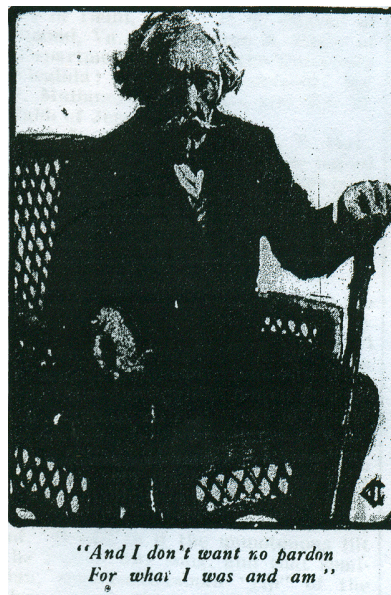
Figure 3: The Collier's rebel.

Fagan's publication. However, the fact he mentions the words are sung to the tune of "Joe Bowers" suggests familiarity with at least the sheet music examined above. Collier's included a picture of an old rebel, complete with white hair, matching mustache and goatee, as well as a cane, a bowtie, and seated in a wicker rocker. 106 This depiction offers yet another artistic rendering of the rebel, albeit a seemingly harmless, geriatric version that belies the violent tone of the lyrics, and situates the song's sentiment in the past as a nod to the popular themes of sectional reconciliation.