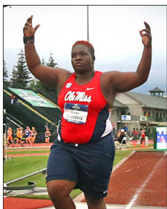
RAVEN SAUNDERS 2016 Outdoor Shot Put 2017 Indoor Shot Put