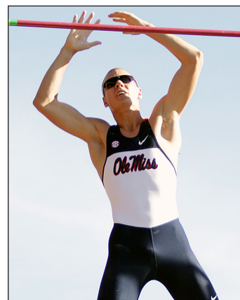
SAM KENDRICKS 2013, 2014 Outdoor Pole Vault