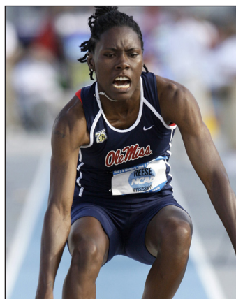
BRITTNEY REESE 2008 Indoor Long Jump 2008 Outdoor Long Jump