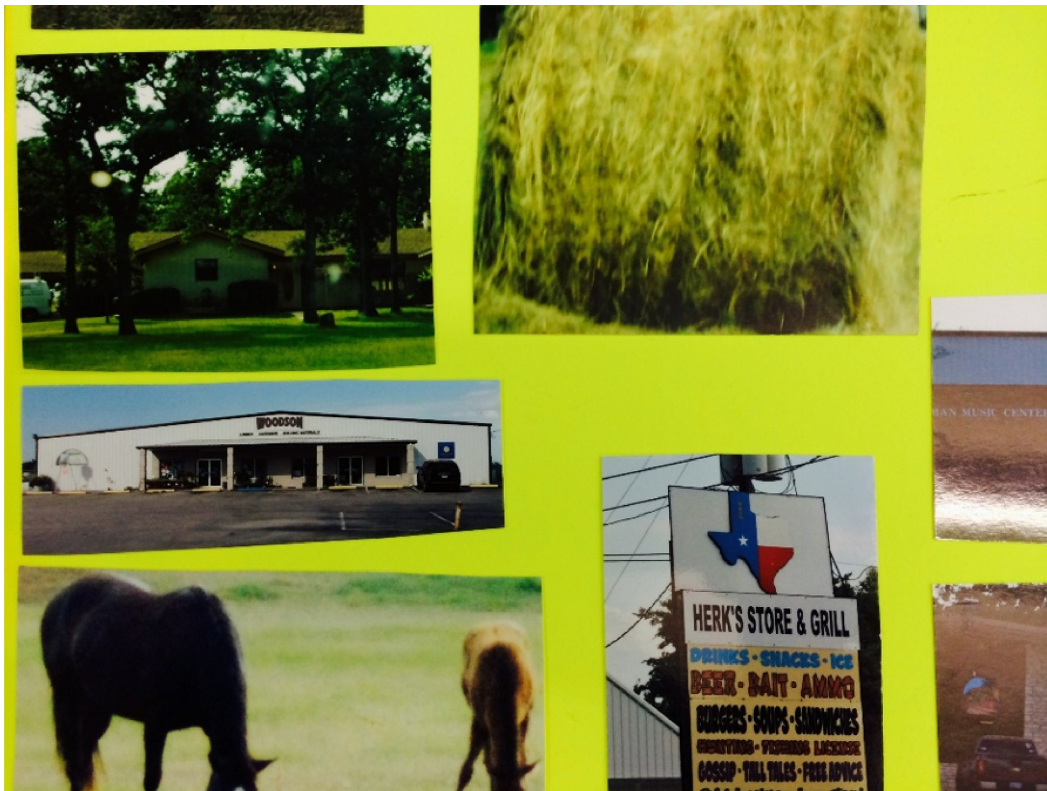
FIGURE 2. PHOTOLITERACY PROJECT OF IMPORTANT PLACES AND ASPECTS OF RURAL TOWN.

services, schools, Head Start programs, women and children advocacy centers, and food banks. The influence of agriculture was pervasive: participants pointed out the significance of grain elevators, feed and supply stores, sale barns, and the local livestock commission, and photographs of horses and cattle appeared frequently in collages aiming to describe the local area. Hardware stores, dollar-stores, and convenience stores also figured prominently when participants sought to explain what was important to them about their towns. Perhaps unsurprisingly, the youth participants expressed gratitude for local coffee shops that offered free wi-fi, commenting that these spaces were gathering places for young and old alike.