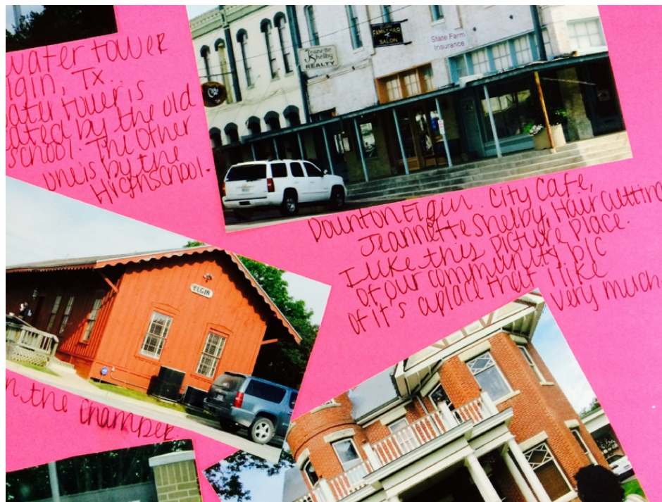
FIGURE 1. STUDENT PHOTOLITERACY PROJECT USING HISTORICAL BUILDINGS AND OTHER STRUCTURES TO DEMONSTRATE PRIDE AND TRADITION.

The topic of pride was decidedly prevalent, as participants noted a general sense of pride in the schools, the athletic teams, their town, their state, and their country. Pride, patriotism, and a respect for history were displayed repeatedly in the photoliteracy collages through images of school mascots, the Texas state flag, and local landmarks such as historic courthouses, city buildings, and museums. Participants also photographed artifacts such as a flag from the Battleship Texas and an antique handgun used in the Civil War. In one town, many participants indicated the importance of the “Muster Tree,” an oak tree where soldiers would meet before leaving for war.