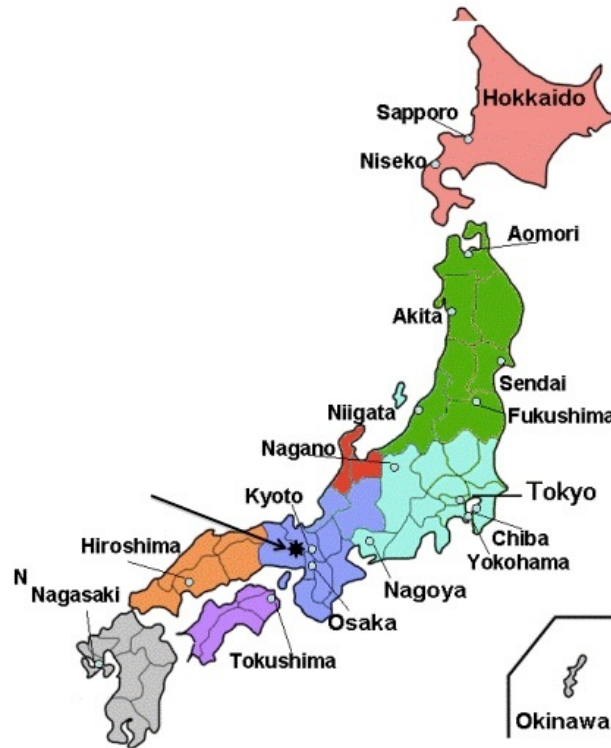
FIGURE 1. MAP OF JAPAN.