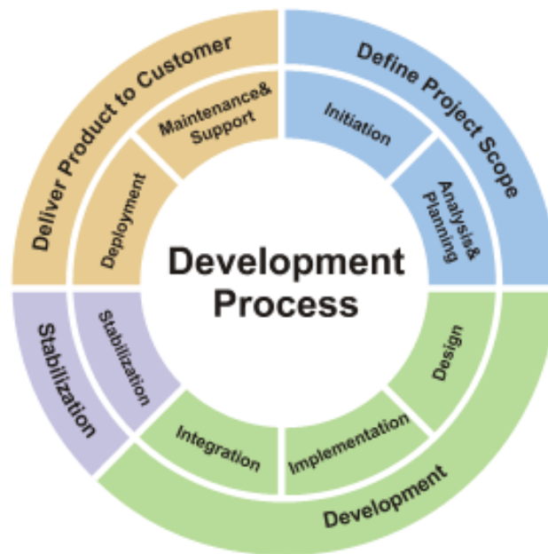
Figure 2. Sample development process of application software

examination determined by the size and complexity of the entity. Also business processes and business functional units, in some degree, affect company's internal controls objectives. Thus, it is necessary to examine an entity's business process, business operational lines, and financial reporting systems. It is extremely difficult, for external financial report user, to scaling the risks examination or addressing the risk of fraud based on public resources. However, a general audit blue print for financial reporting audit could be discussed and implemented over the observations on common industrial business process and specific financial reporting disclosures. Figure 2 is a sample business process of software development in application software industry. 25