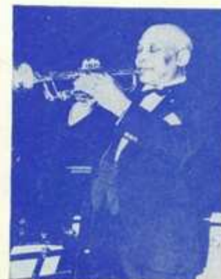
AS PLAYED BY THE COMPOSER HIMSELF