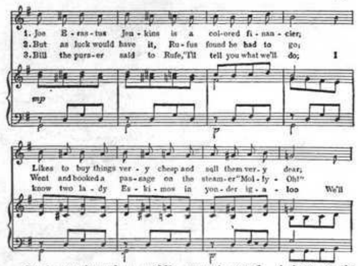
Comic novelty whose middle name is speed. A boon to the singing comedian.