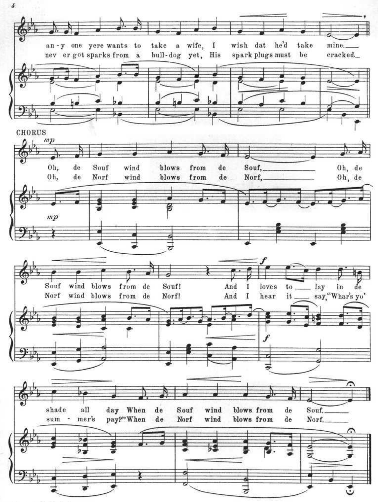
De Wes' Wind 4