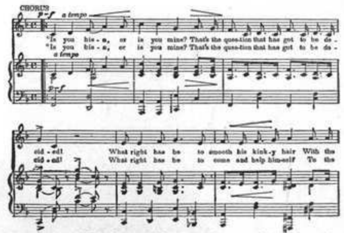
Laughable darky ditty, with a surprise punch in the ending. Solo or chorus.