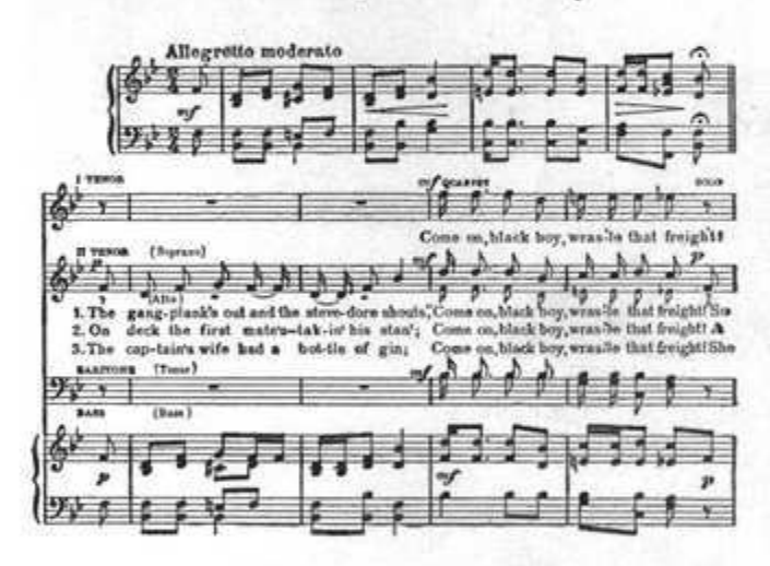
A gem of minstrel humor for male or mixed quartet, with a catchy refrain and encore stanzas galore.