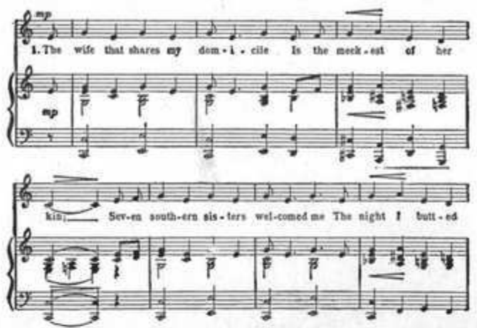
Something novel in coon songs, with comic spoken "patter" interspersed in the music. A gale of mirth.