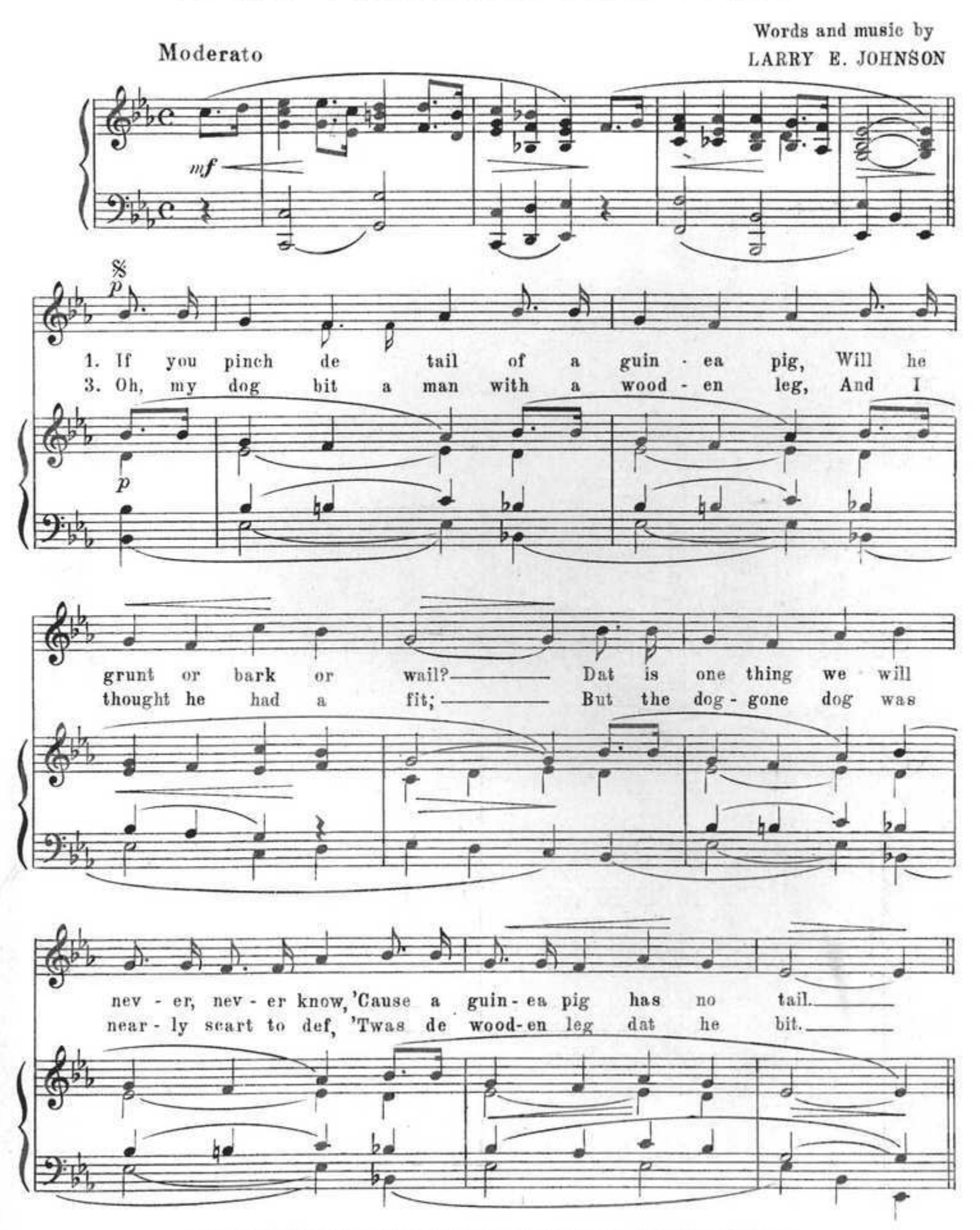
Copyright MCMXXIV by T. S. Denison & Company, Publishers, Chicago British Copyright Secured