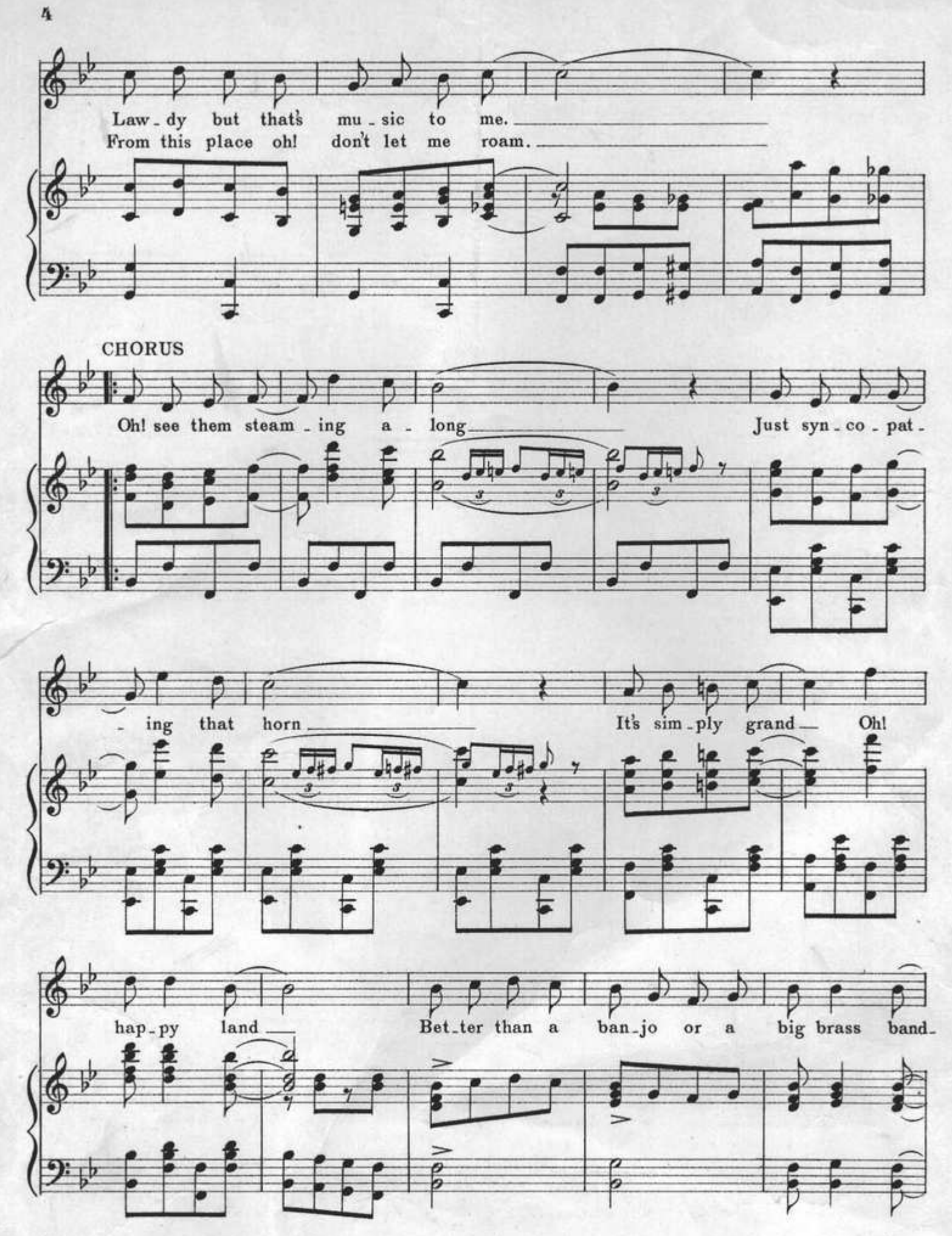
When the Steamboats, 4