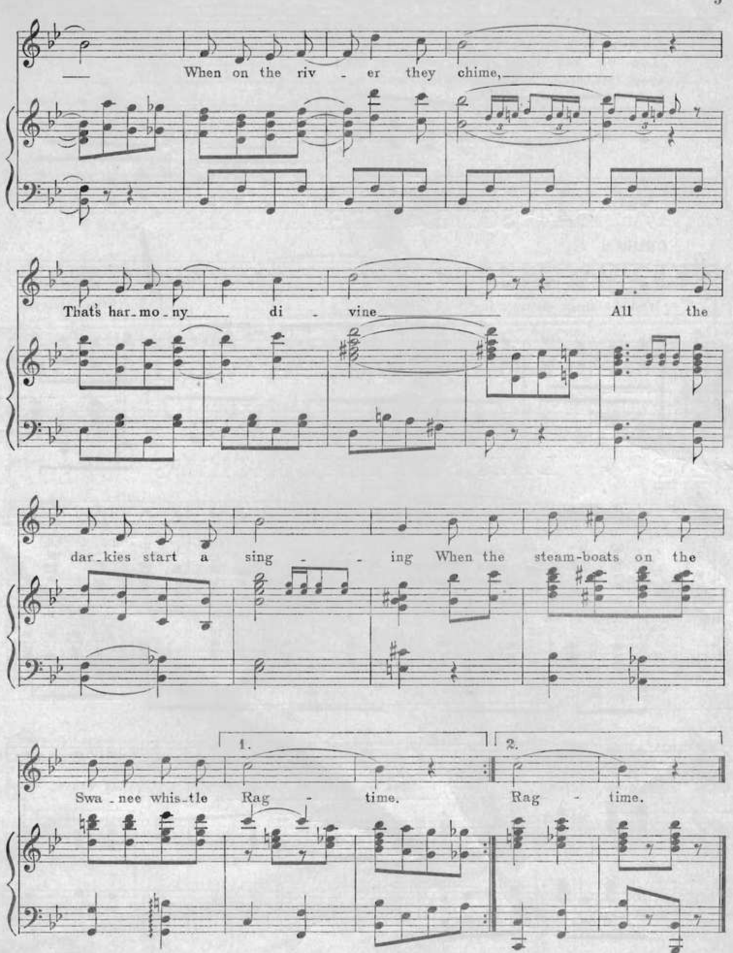
When the Steamboats, 4