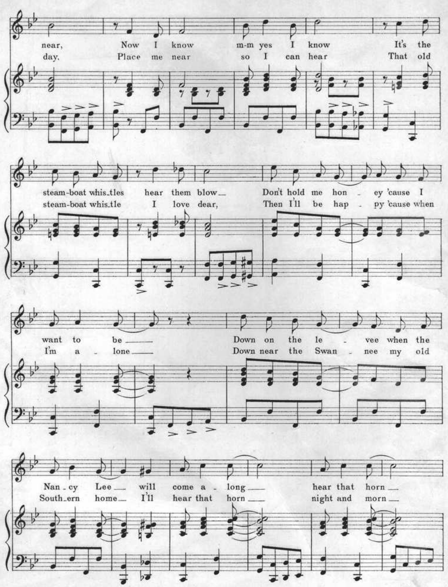
When the Steamboats, 4